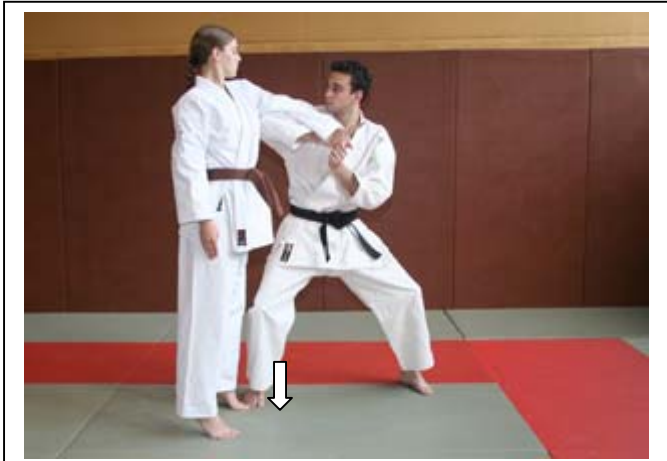
CLE DE BASE