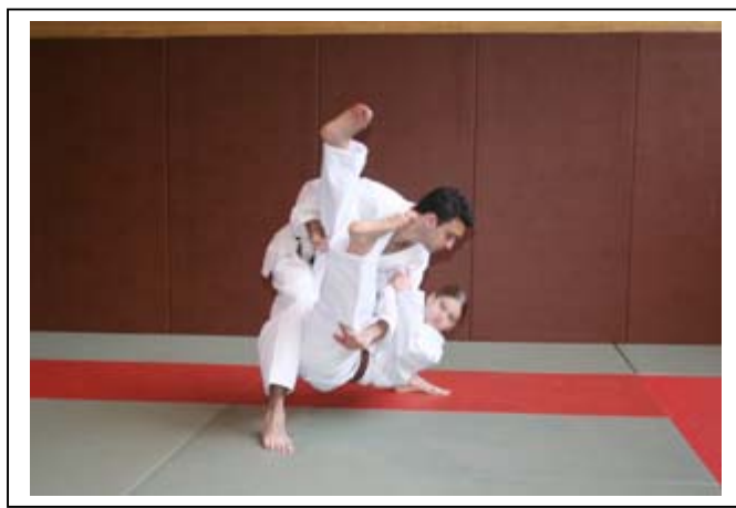
PROJECTION DE BASE