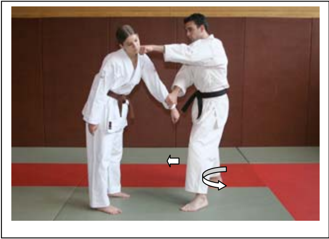
ATEMI DE BASE