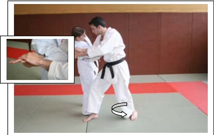
CLE DE BASE