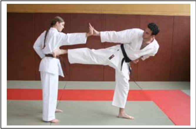
ATEMI DE BASE