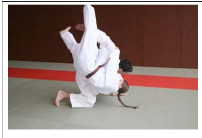
PROJECTION DE BASE